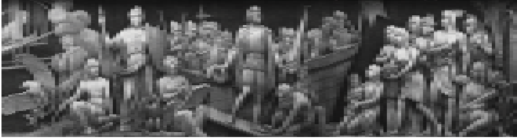
America in History