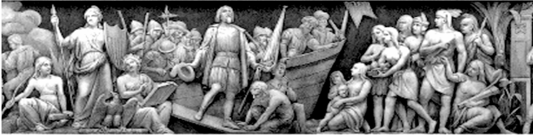
America in History