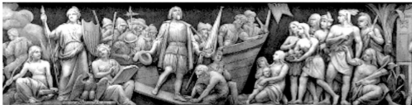
America in History