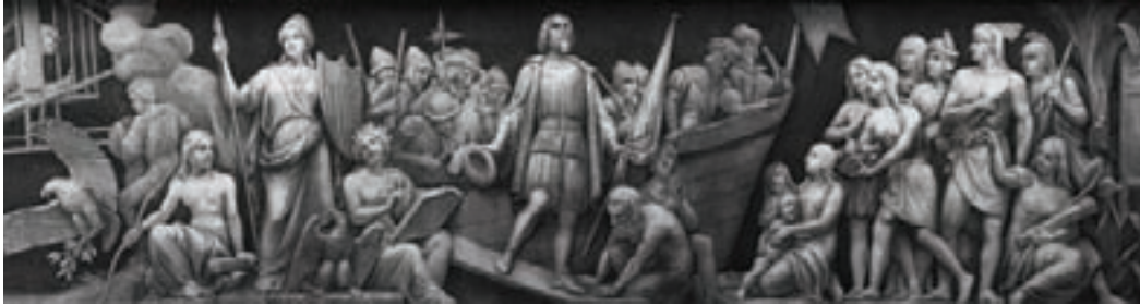
America in History