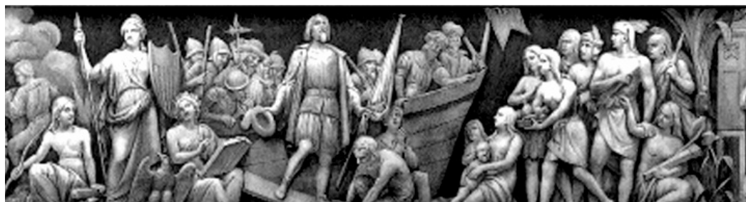
America in History