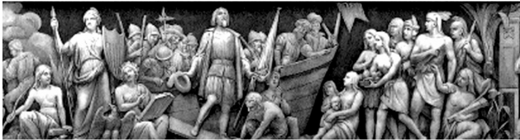
America in History