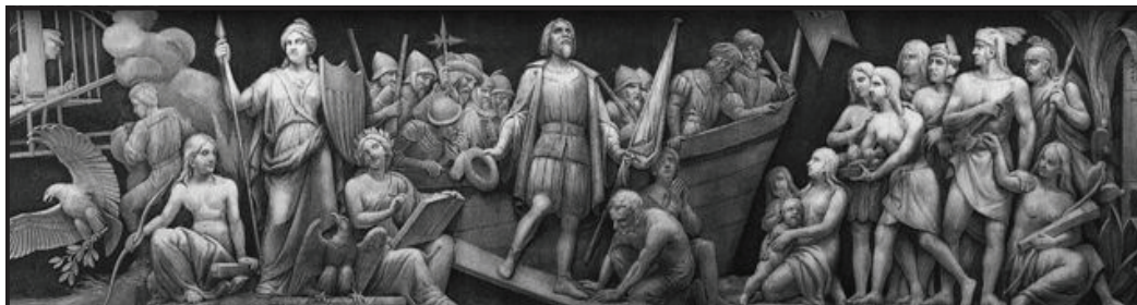
America in History